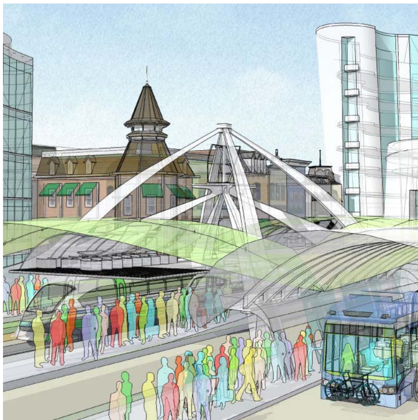
Rendering from Transportation Section of Go To 2040 . Source: CMAP

GO TO 2040 exists as two documents: a full-length plan that is for policy experts, and a shorter plan that is for broader audiences. Both versions call on local officials, businesses, and other stakeholder groups to implement recommendations that -- while very specific -- have broad implications for residents' daily lives. To illustrate that point, CMAP has profiled several residents whose stories help to bring the plan to life. More information about GO TO 2040 can be found at the CMAP website .