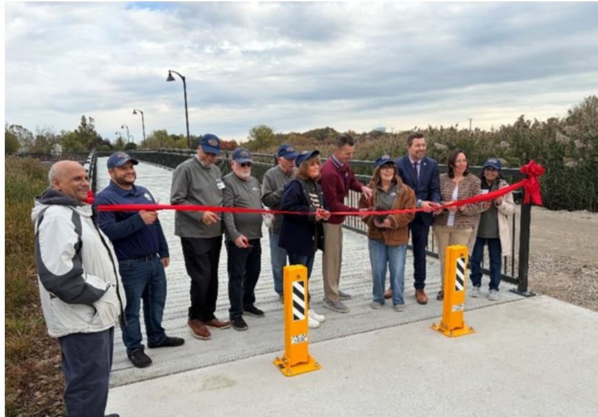
Streamwood Route 59 Pedestrian Overpass Ribbon Cutting Ceremony