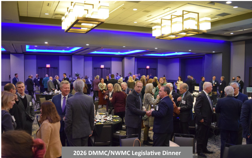
2026 DMMC/NWMC Legislative Dinner