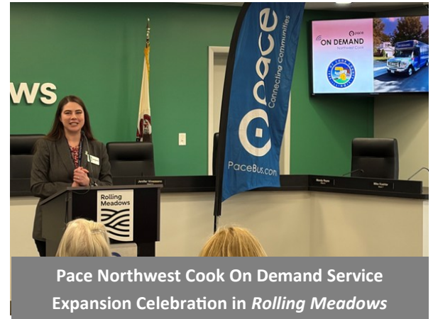
Pace Northwest Cook On Demand Service Expansion Celebration in Rolling Meadows