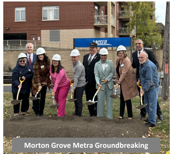
Morton Grove Metra Groundbreaking