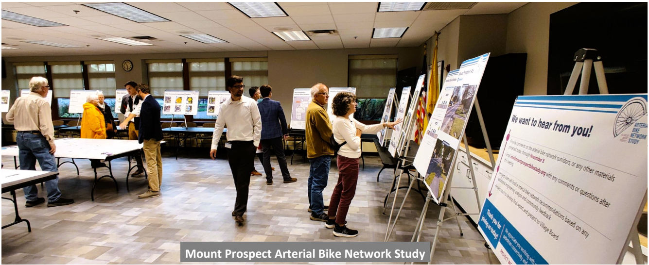
Mount Prospect Arterial Bike Network Study